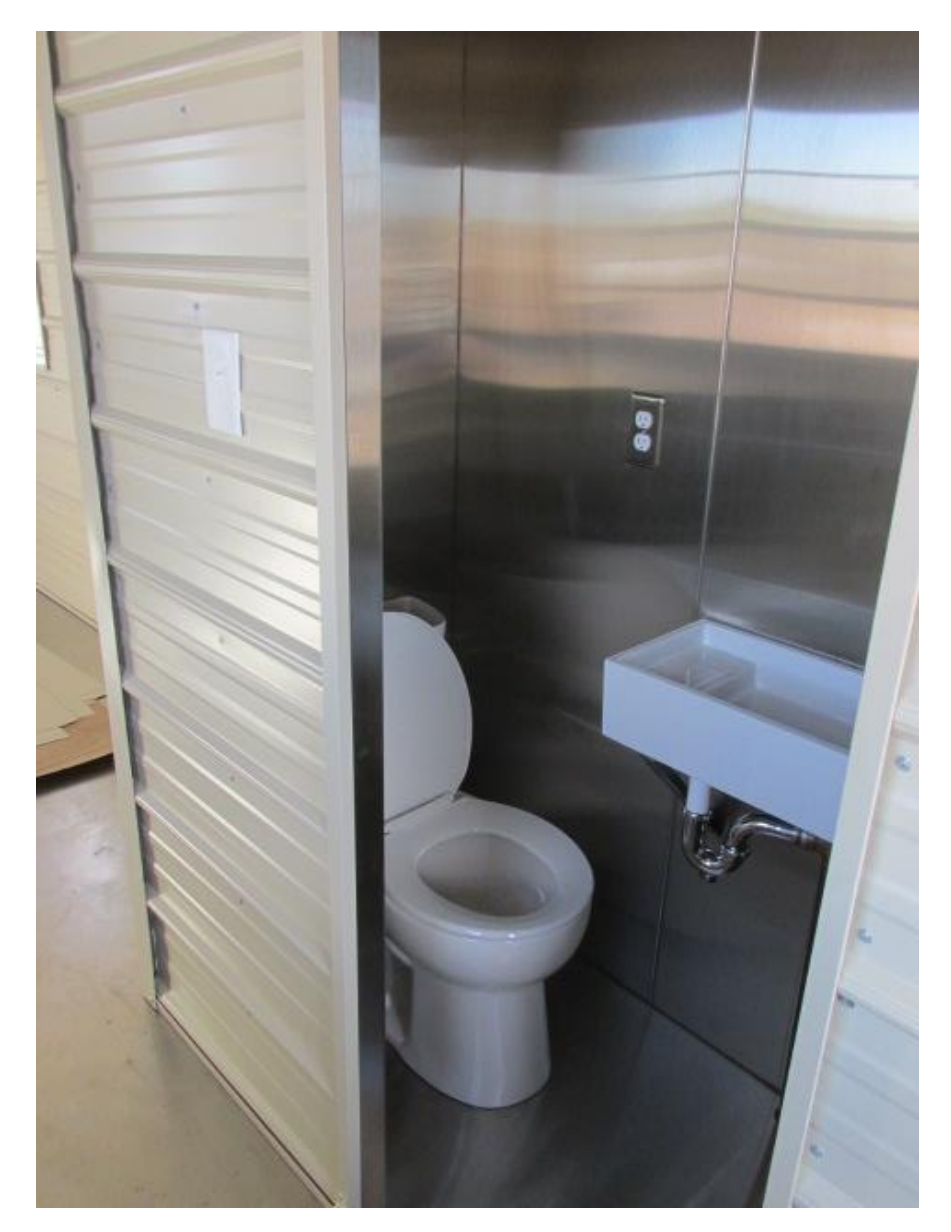
All-stainless steel bathroom in an MCS tiny house.

Having your own flushing toilet is probably a necessity. A tiny house with no bathroom will only work if parked near a non-toxic bathroom, and those are very scarce. Even if one is available now, it may be difficult to find another one if having to move again.