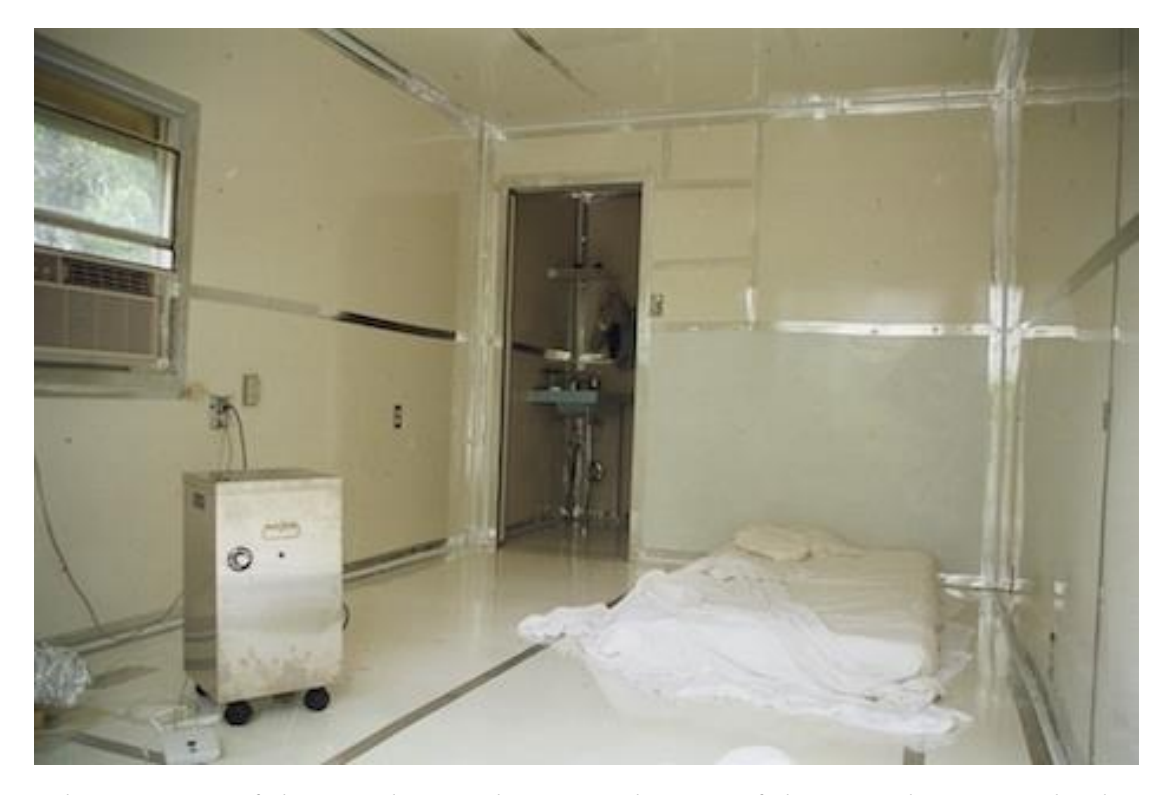
The interior of the tiny home shown at the top of this article. It was built around 1990 and has a bathroom in the back. The inside and outside walls are all made of metal (we're not sure whether it is anodized aluminum or porcelain-on-steel).

Some people have a wooden floor which is then covered with an airtight membrane, such as polyethylene plastic or laminated aluminum foil. Porcelain tiles can be placed loosely on top, without any glue or grout (ceramic tiles are not strong enough). Loose tiles must be pulled up at least once a year for cleaning underneath.