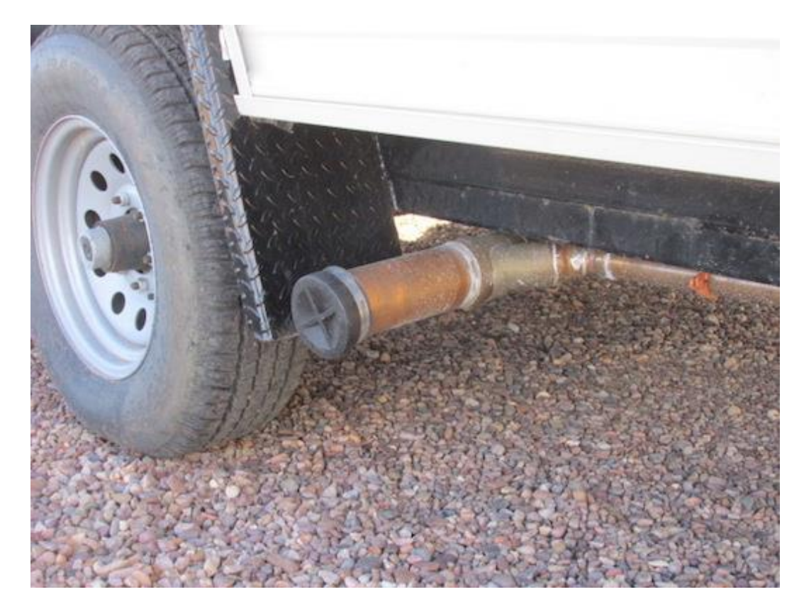
Outlet for sewage water.

If you plan on living at a remote site with no utilities, tanks can be useful, though it may work better to have a larger water tank in a separate shed, with a small solar-powered pressure pump there as well. This setup is more protected against freezing and it may work better with a bigger tank if having water delivered by tanker truck. Placing the pressure pump in the shed omits the EMF issue and greatly cuts down on the noise (these pumps are very noisy).