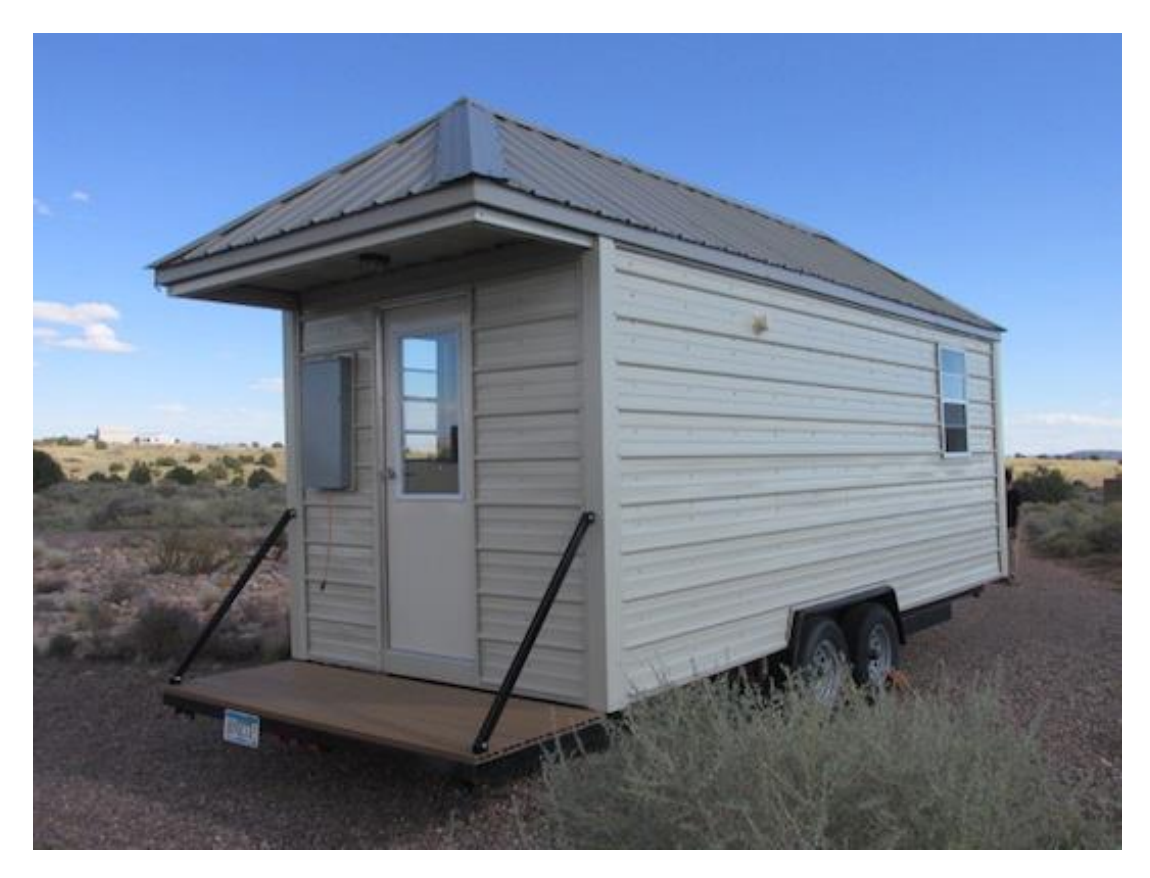
Tiny house made entirely of steel.

feasible to move seasonally to a warmer winter location or a cooler summer location – or to escape wood smoke during the winter.