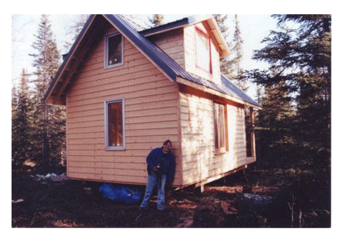
Tiny house built of wooden boards. It was all non-electric and heated by a wood stove.

The electrical box should be located furthest away from the sleeping area. Also take care in the routing of cables going from the breaker box to major electrical appliances, so they do not run next to where people sit or sleep.