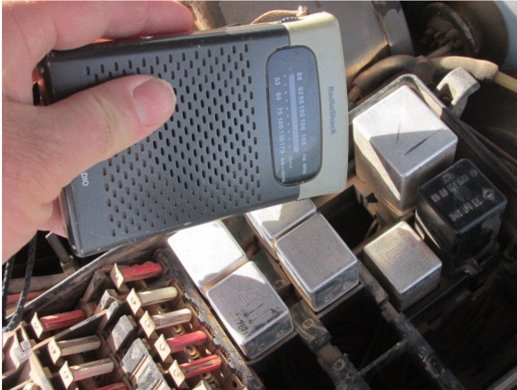
Using an AM radio to check for fluttering or arching relays.

Any fluttering relay should be easily heard in the radio. Pull out the relays one at a time to determine the faulty relay.