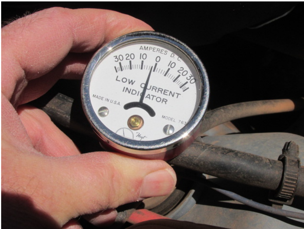
Low-cost DC clamp-on ammeter.

The most effective way to handle the alternator problems is to disconnect it entirely. It is sometimes possible to instead let the car run off a battery. This is much better, because a battery does not produce any pulsing DC and thus no EMF. (If the alternator is running, a gaussmeter will show EMF on the battery, but that is because of the alternator and other sources of dirty DC, not the battery itself.) This is only realistic on cars that use very little electricity, such as older cars with a diesel engine. It may not make sense to attempt to this with a gasoline engine since the ignition systems generate a lot of pulses on their own, and consumes a lot of electricity.