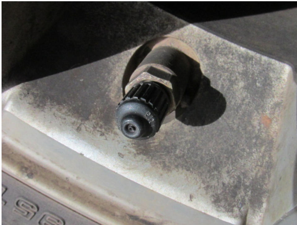
A battery powered wireless monitor built into the valve.

The "direct" systems actually measure the air pressure in each tire and transmit it wirelessly to a receiver someplace in the car. The sensor is built into the air valve on the tire. The sensor is usually powered by a tiny battery built into the sensor. It may be possible to replace the air valve with one without a built-in sensor, or it may be possible to drain the battery in each sensor, or get old sensors with worn-out batteries.