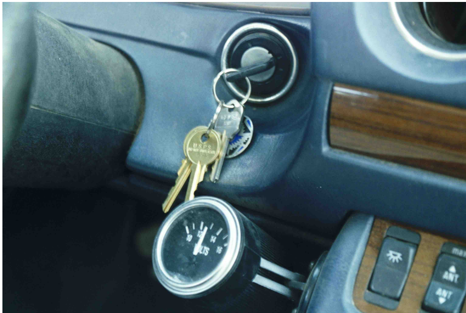
A voltmeter is needed to monitor the battery.

The size of the solar panel depends on how much electricity is needed and the climate. There are people in the sunny Arizonan desert whose cars consume about 10 watts and can be driven all day long with a 40 watt solar panel.