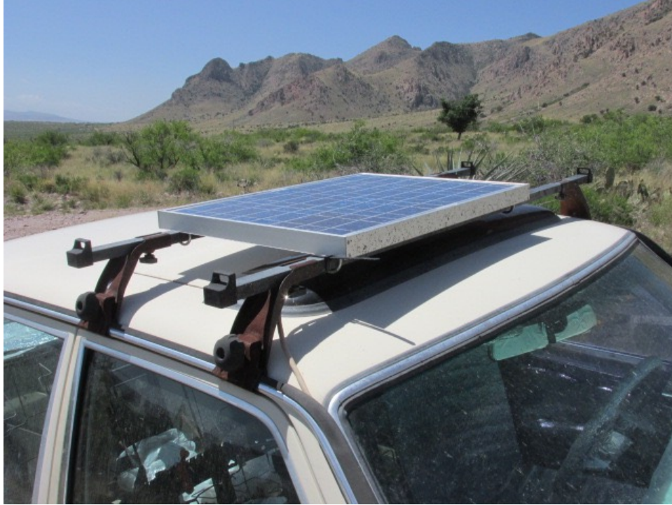
A 60 watt solar panel mounted on a roof rack on a car without an alternator.