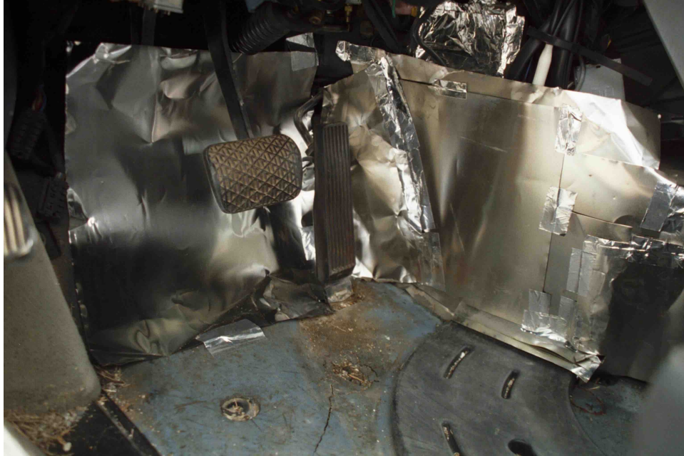
Shielding of a footwell using mumetal foil. Once the panels were put back in place, the shielding was no longer visible. In this case, the shielding reduced low-frequency radiation by about half, which is actually very little.

In general, steel, silicone steel and mumetal (special alloys) are best for low frequencies, while aluminum foil is best for radio frequencies.